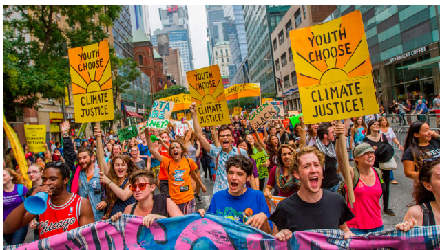
Figure 1. People’s Climate March, NYC, September 2014.

The movement emerged organically out of various Blockadia-style attempts to block carbon extraction at its source, specifically, the movement against mountaintop-removal coalmining in Appalachia in 2011 (Klein 2015). Blockadia, Naomi Klein writes, is a “roving transnational conflict zone that is cropping up with increasing frequency and intensity wherever extractive projects are attempting to dig and drill, whether for open pit mines, gas fracking, or tar sands pipelines” (Klein 2015, pp. 294–295). FFD had its beginnings at Swarthmore College in 2010, when students started the Swarthmore Mountain Justice campaign. Organisers adopted the tactic of divestment in solidarity with Appalachian communities (Bratman et al. 2016). In 2011 and 2012, several other HEIs, including Brown University, began coal divestment campaigns. Student activists were later joined by a national