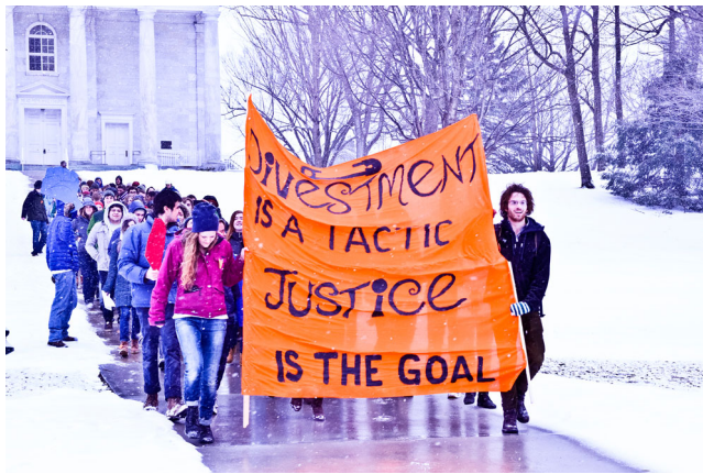
Figure 2. Middlebury College students linking their divestment campaign to a call for climate justice.

and then international campaign spearheaded by 350.org, which extended the divestment call beyond coal to the 200 leading publicly traded fossil fuel companies (i.e. CU200). Of the 81 HEIs divestment commitments worldwide, nearly half are US institutions (40), while the remainder are from the UK (26), Australia (6), Sweden (3), New Zealand (3), Canada (1), Denmark (1) and the Marshall Islands (1).