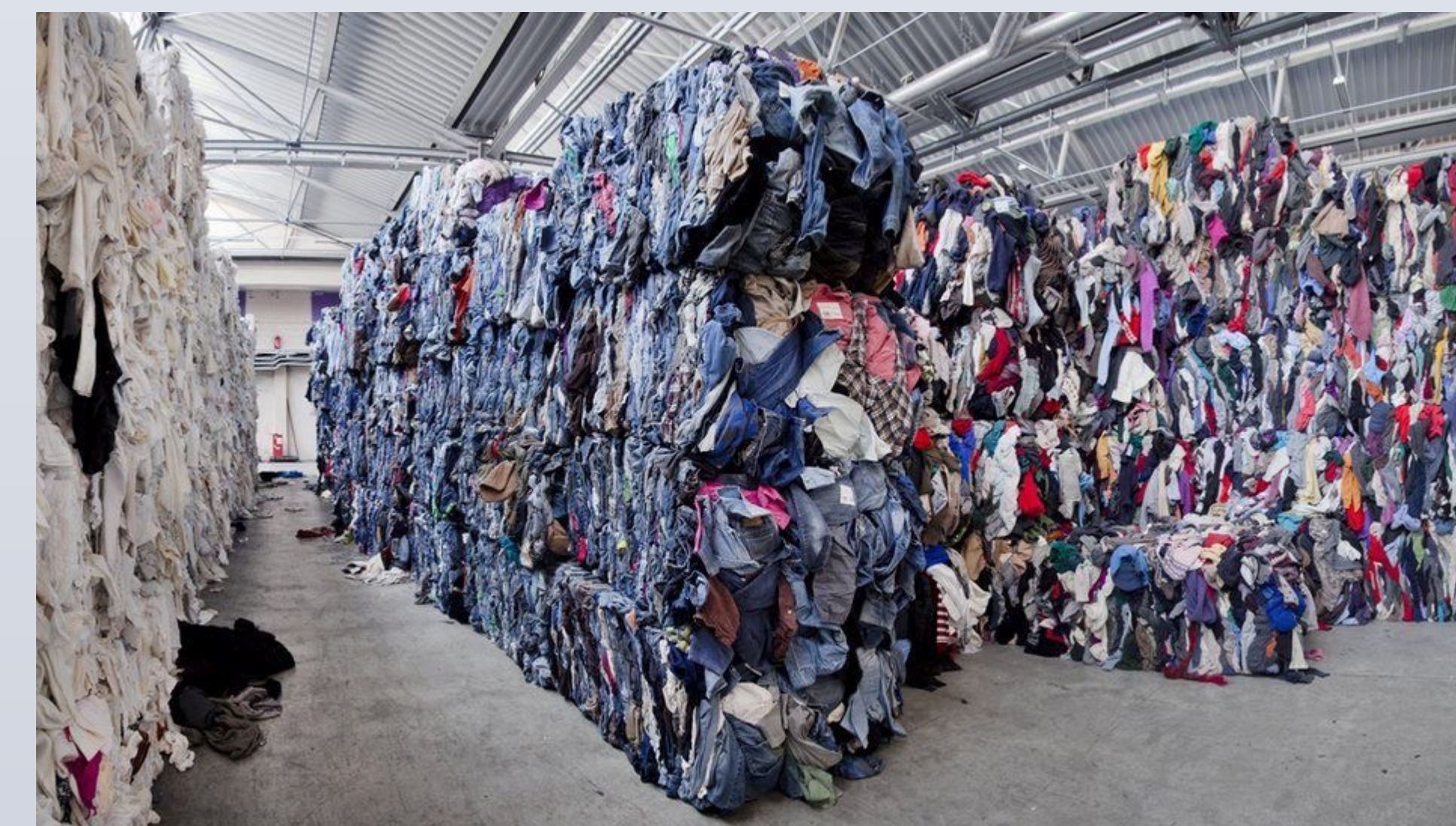
Figure 3: Bails of clothing that are sent to be resold in under-developed countries