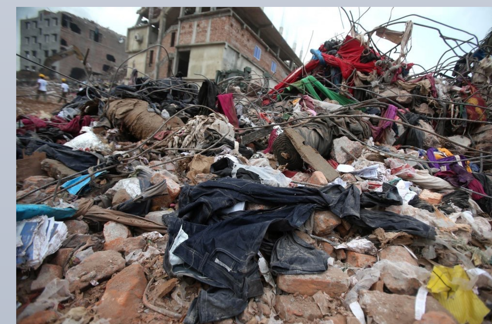
Figure 7: A waste pile of clothing and various textiles in a landfill. (Schlossberg 2019)