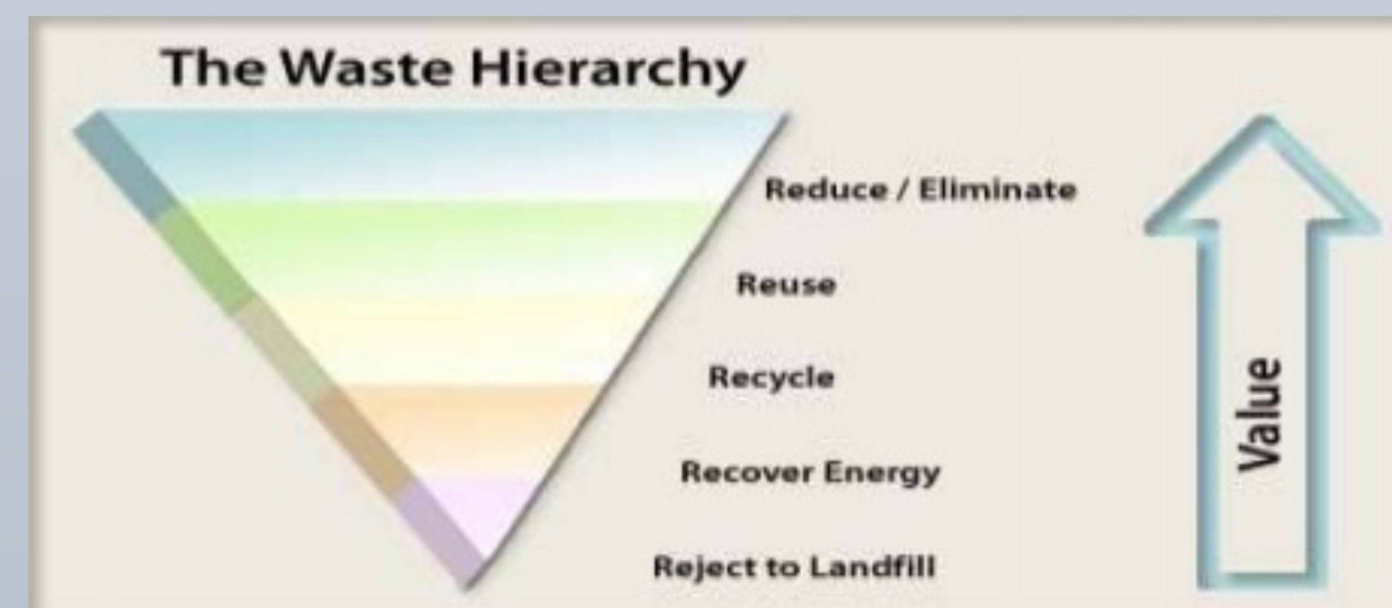
Figure 6: The waste hierarchy stating the importance to each way products are reduced, reduced, and recycled. (Mukherjee 2015)

As shown in the Waste Hierarchy graph (Figure 6), rejecting old textiles to a landfill (Figure 7) has the largest environmental impact and the lowest value to our lives sustainably. Recycling is in the middle making the value higher than rejecting to a landfill but still not high enough on the graph. The best we can do for the value of our lives is to reduce and eliminate. We must create less waste, create less emissions, and increase the local economy by choosing local fashion over fast fashion.