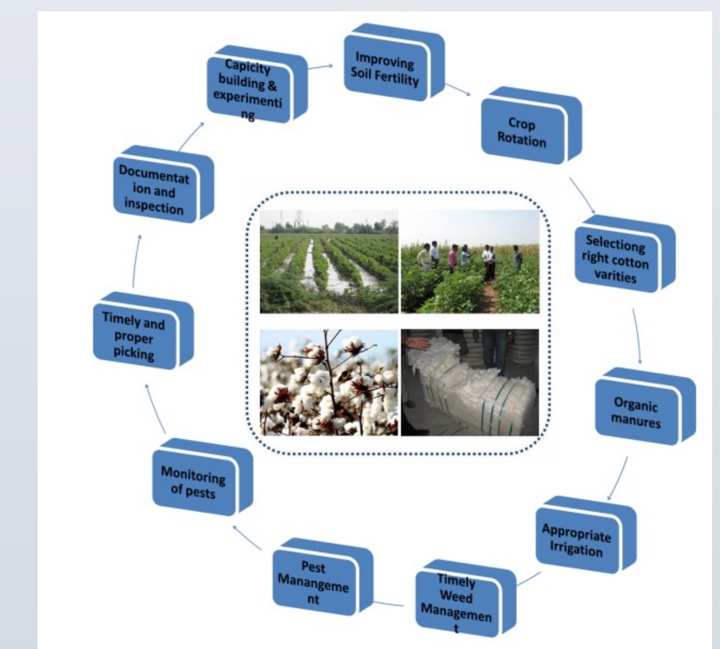
Figure 5: The systematic approach to growing organic cotton (Ali and Sarwar 2010)