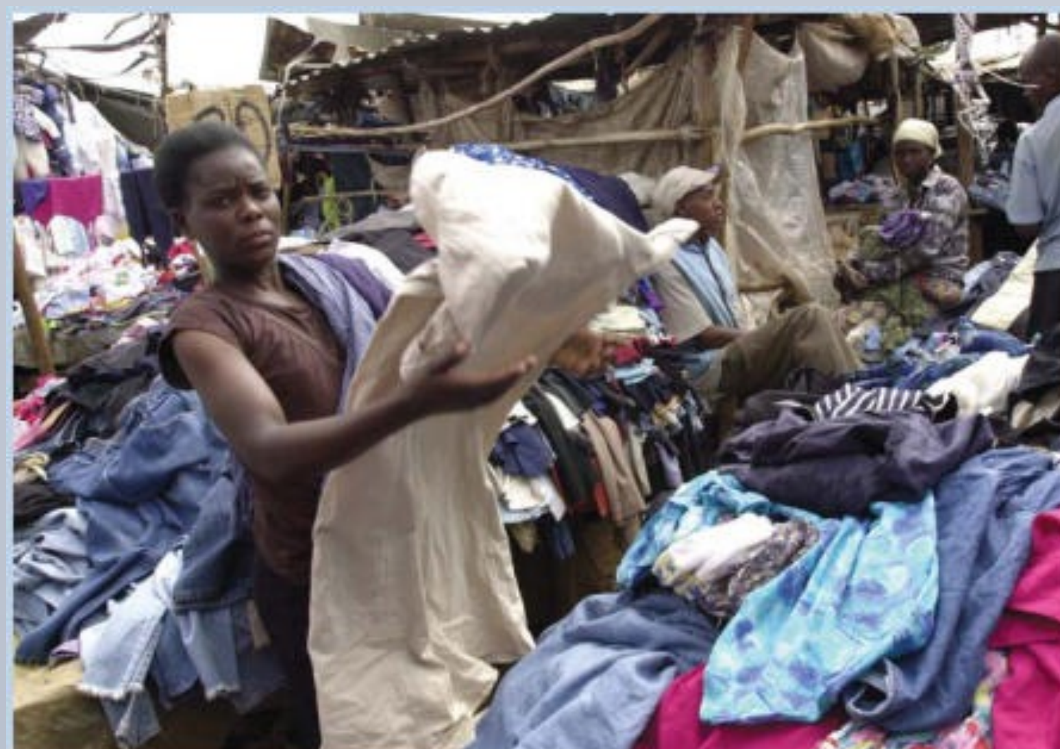
Figure 4: A woman at a second-hand market in Nairobi, Kenya. These clothes are sold per piece or by weight. (Claudio 2007)