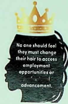
Dove is a proud co-founder of the CROWN Coalition to advance hair discrimination legislation called the CROWN Act