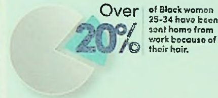
Black women's hair is 2.5x more likely to be perceived as unprofessional

Cheyenne Cochrane gave a speech on TED Talk about the Crown Act. Post Civil War, the natural hair was, "the hair of an African American, male or female, that was known as the most telling feature of negro status." She talked about how much discrimination there was on the texture of hair. It is shocking that the Crown Act hasn't been approved in all states. They can still discriminate on someone's natural hair unless