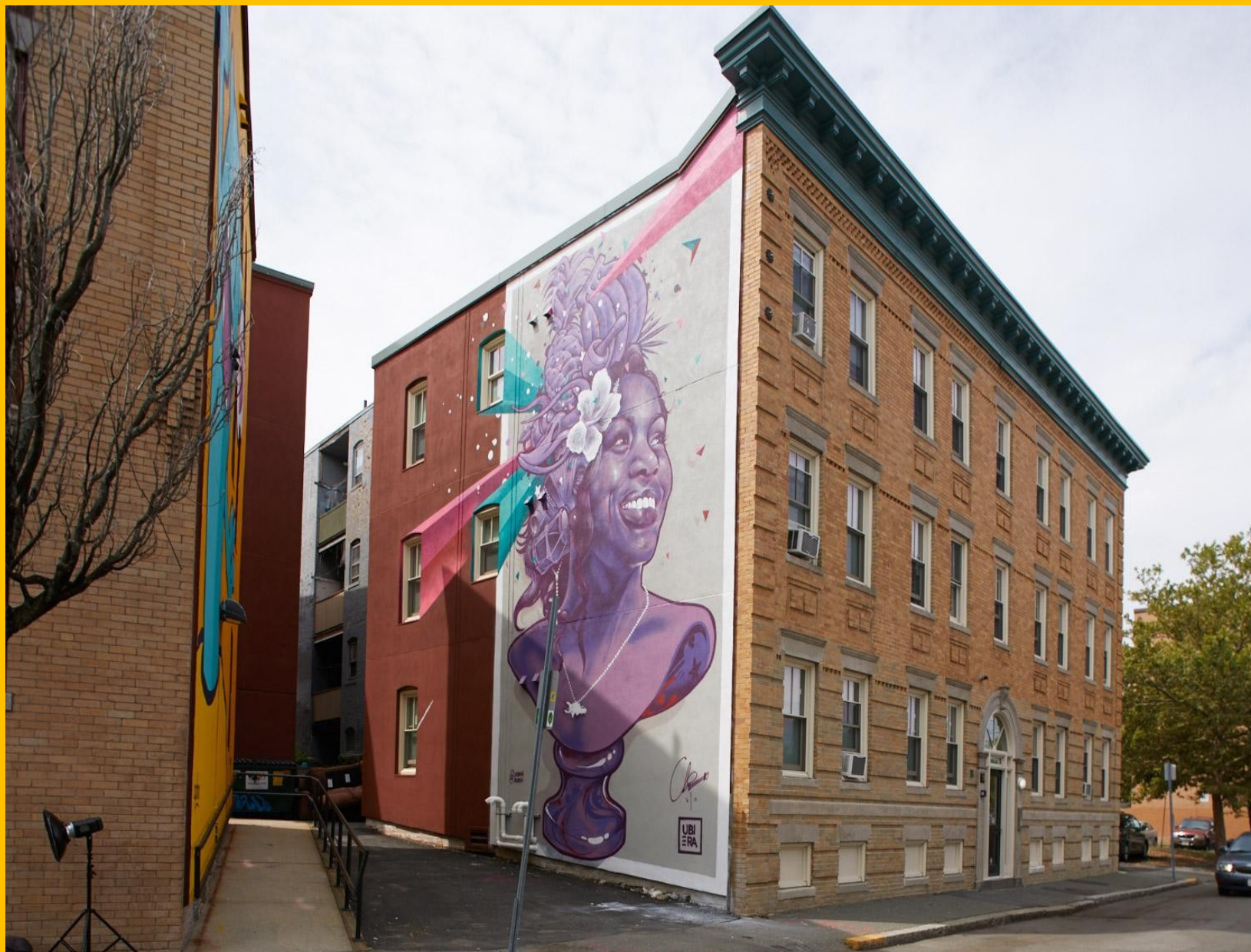
Anacaona street view